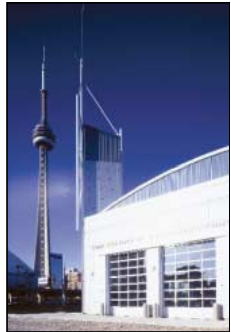
View of Harbourfront Fire Station from opposite side of building. The building tower, in addition to adding architectural interest, serves as a hose drying facility.