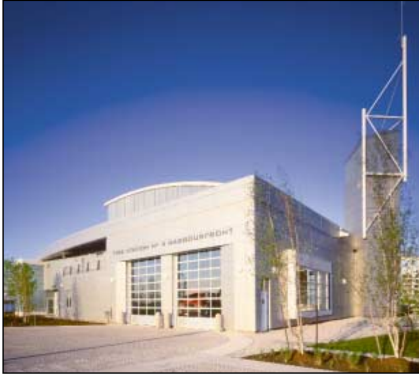
Harbourfront Fire Station, Queen's Quay, Toronto. Jurecka + Associates/ architecture and design. Kanalco "Series 1 Dry Set" panel system consists of 1579 m 2 (17,000 sq. ft.) of 4 mm PE (Polyethylene) core material with Champagne Metallic and Pure White Finish. Photographer: Peter Sellar.

07430 OCT 2000 Composite Metal Building Panels KANALCO LTD.